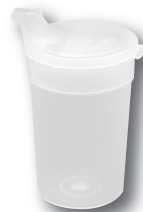
60-1210 vacuum cup 60-1210-10 box of 10