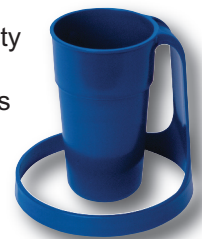
60-1062 halo cup