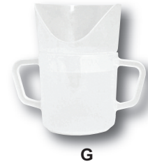
G 60-1043 2-handled, 8 oz 8.00