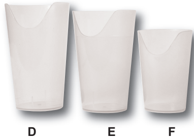
■ tint color varies D 60-1040 4 oz, clear E 60-1041 8 oz, clear F 60-1042 12 oz, clear